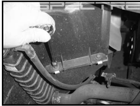
Step 10 Remove the 10mm screws holding the fan shroud on both sides. Remove shroud.