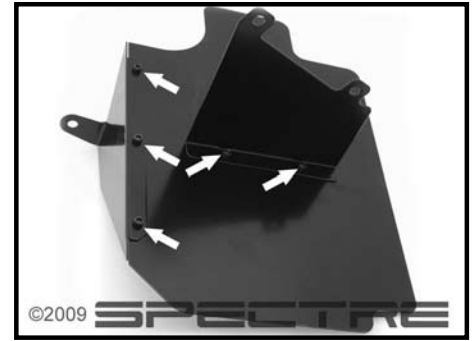
Step 11 Using the included 5mm Allen bolts, lock nuts and washers, assemble the heat shield as shown. Install the Allen bolts from the top of the flanges and put the flat washer and lock nuts on the back. Once all the hardware is installed, use the included hex key wrench and an 8mm (5/16" will also work) wrench to fully tighten all of the lock nuts.