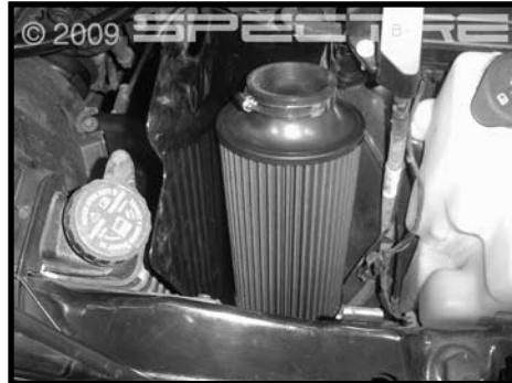
Step 18 Place the air filter in the housing assembly.