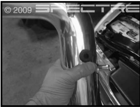
Step 17 Insert the rubber grommet and insert the IAT sensor.