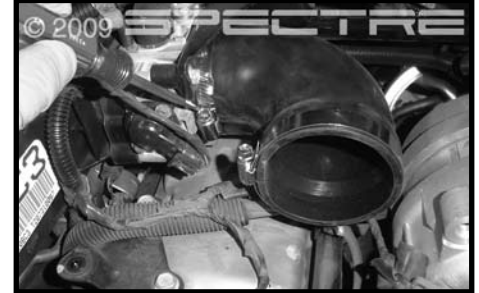
Step 16 Place coupler over throttle body secure with clamps.