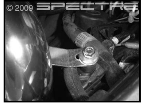
Step 19 Place tube into coupler, secure the hose clamps. Attach the bracket on the intake tube to the vibration mount. Secure with provided washer and nut.