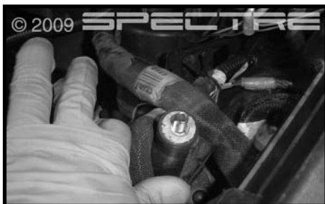
Step 14 Insert threaded vibration mount in the OE air box mount location.