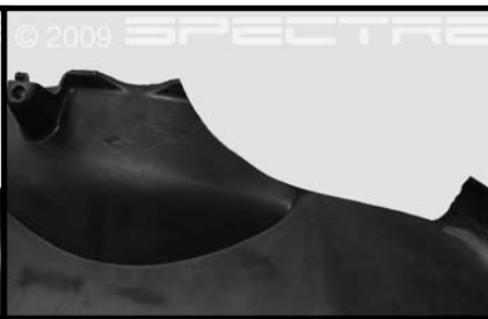
Step 13 Re install fan shroud. Install the air filter shield. Secure with factory screws.