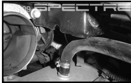
Step 15 Insert the new breather hose and secure with clamps.