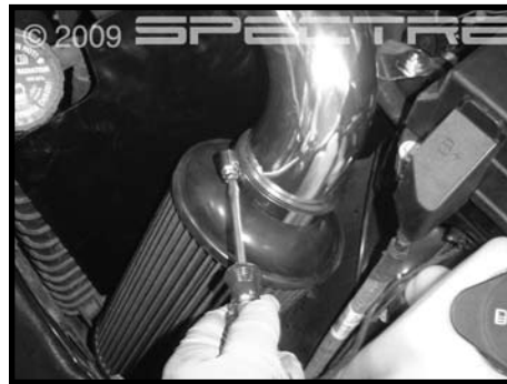
Step 20 Tighten air filter. Insert the breather hose and clamp. Tighten all clamps.